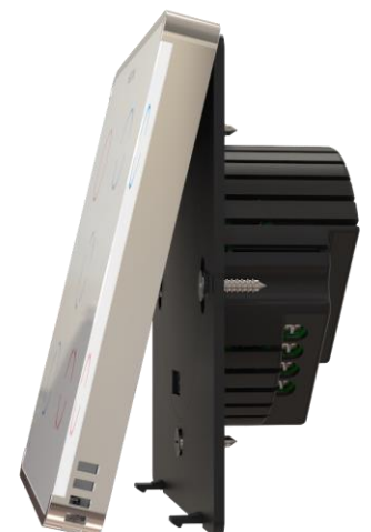
Figure 3: Install Touch Panel Unit

Note: Zero-Cross technology is unavailable if the device operates using DC voltage (24-48VDC).